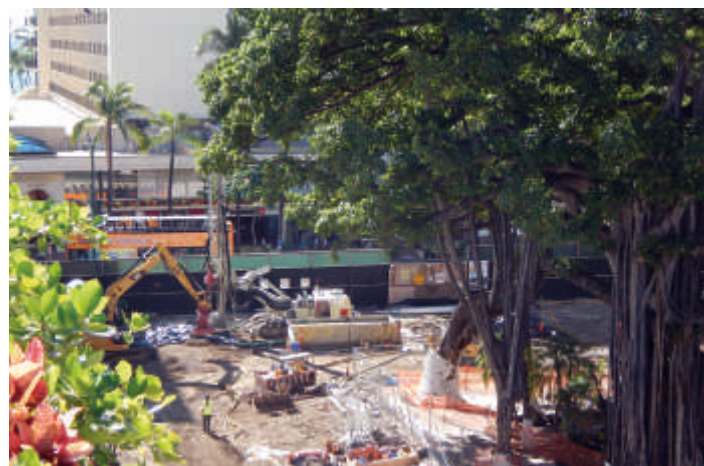
Micropile drilling under the Banyan tree