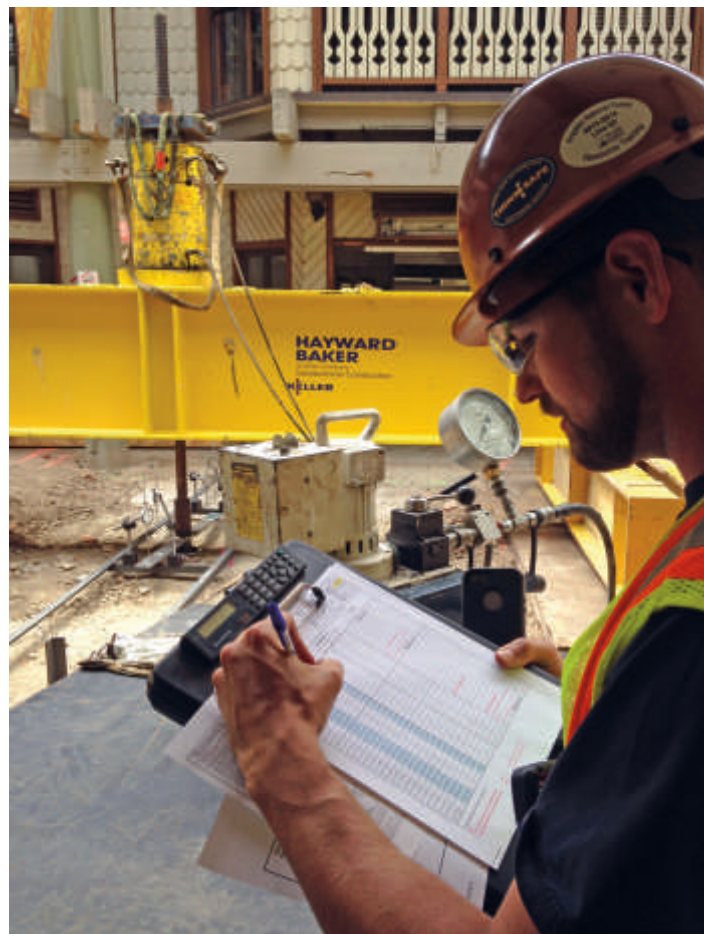
Observing a micropile load test

except a select few which were replaced without investigation per access restraints. The vast majority of the installed piles were without anomaly and without concern of being affected. Of the suspect piles identified, several were found to have bond zones with anomalous grout that were partially or completely washed out. After any required consolidation grouting, the reinforcing bars were reinstalled and the micropiles were tremie grouted. An additional 10,300 cu ft (291 cu m) of grout was installed during the remediation of the affected micropiles, including the required consolidation grouting.