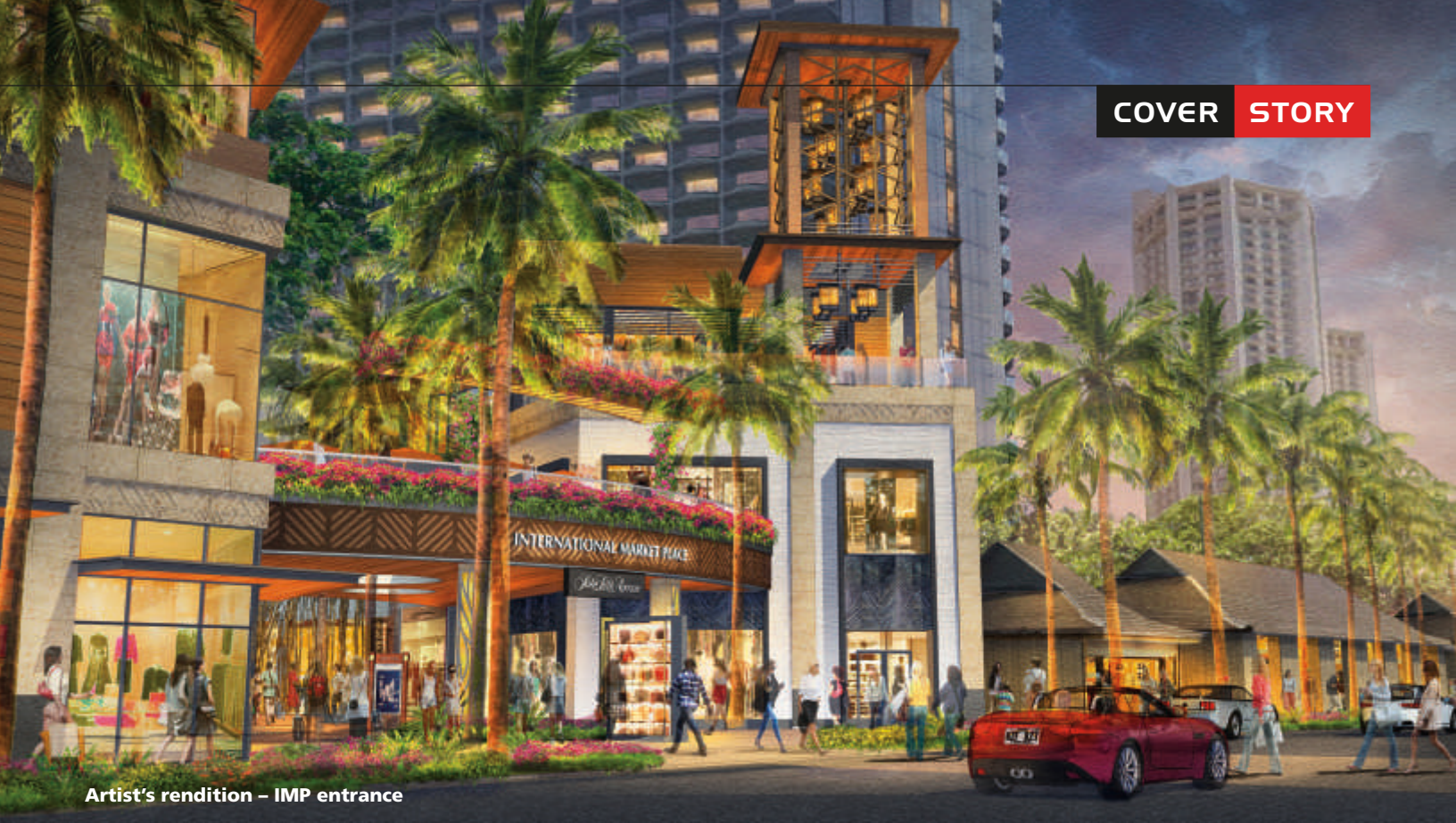
Artist's rendition – IMP entrance